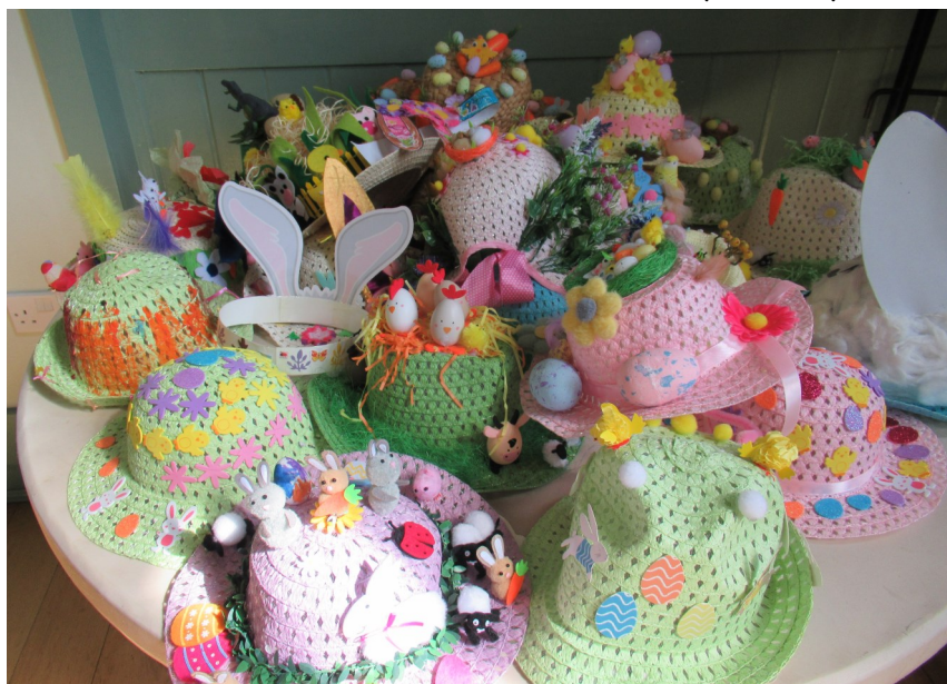
Ash class Easter bonnets