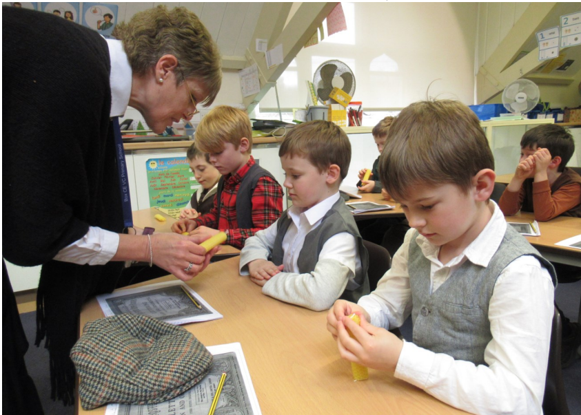
A day of Victorian learning in Willow class