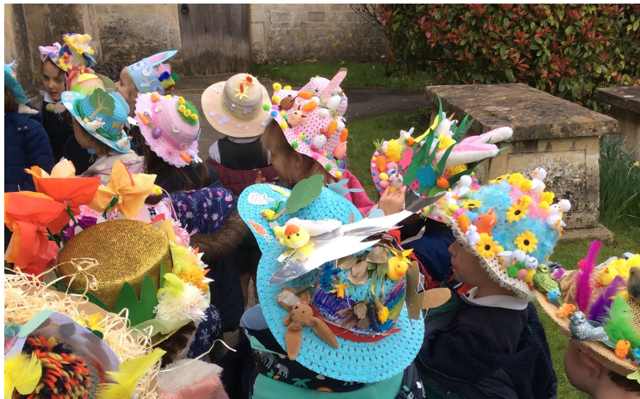
Easter bonnet parade to the church