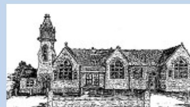
Box CE VC Primary School