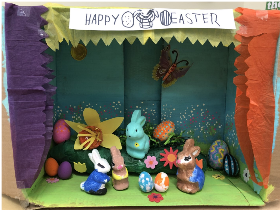
Easter scene made by a child in Beech class.