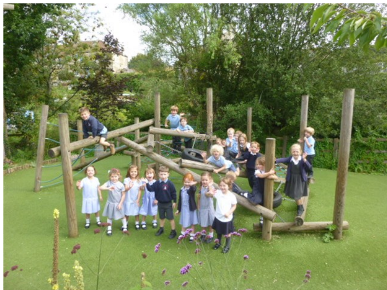
Our reception children September 2018