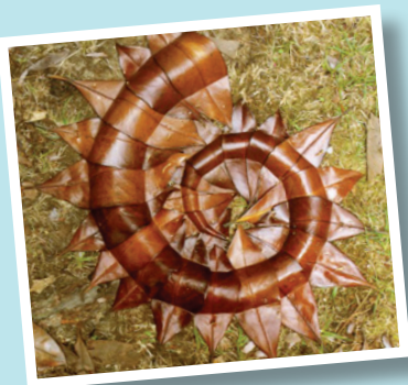
Leaves polished and greased, pinned to the ground with thorns.

Why don't you try making one next time you visit the coast?